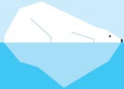
最后的冰山 the last iceberg